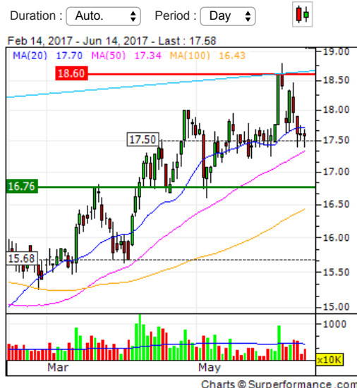
Chart CHINA EVERBRIGHT LIMITED